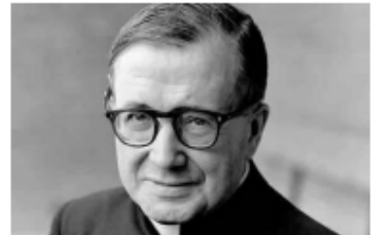
Saint Josemaría Escrivá

Spanish Roman Catholic priest. He founded Opus Dei , an organization of laypeople and priests dedicated to the teaching that everyone is called to holiness by God and to discover sanctity in their ordinary lives. He was canonized in 2002 by Pope John Paul II, who declared Josemaría should be "counted among the great witnesses of Christianity." St. Josemaría Escrivá wrote: "Because Mary is our mother, devotion to her teaches us to be her true sons and daughters: to love truly, without limit; to be simple, without the complications which come from selfishly thinking only about ourselves; to be happy, knowing that nothing can destroy our hope."