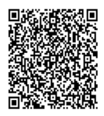
Scan to order! ¡Echa un vistazo para encargar!

Wednesday, November 01, 2023 Our Lady Of Grace Retake Day!