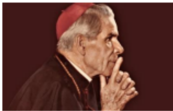
The Venerable Fulton J. Sheen

During the first part of the twentieth century, it was common for Catholics, young and old, on their way home from work or school, en route to the grocery store, or a sports practice, to "stop in for a visit" to the Blessed Sacrament in their local church. Most times the Eucharist was not exposed, but a red candle – then, as now – showed the Lord's Presence in the tabernacle. Since the Second Vatican Council, the Catholic Church has made Eucharistic Exposition and benediction a liturgical service in its own right and exercised more direction over its practice. It draws its primary meaning from the Eucharistic celebration or Mass, itself. "The documents of the Council tell us that "by worshiping the Eucharistic Jesus, we become what God wants us to be! Like a magnet, The Lord draws us to Himself and gently transforms us."