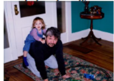
The CRE giving his daughter a Piggy-Back-Ride