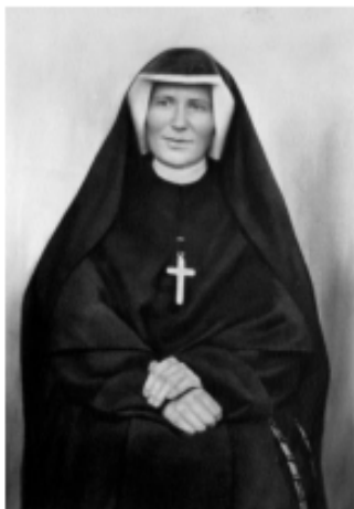
Saint Faustina - Feast Day October 5

At a time when some Catholics had an image of God as such a strict judge that they might be tempted to despair about the possibility of being forgiven, Jesus chose to emphasize his mercy and forgiveness for sins acknowledged and confessed. "I do not want to punish aching mankind," he once told Saint Faustina, "But I desire to heal it, pressing it to my merciful heart." The two rays emanating from Christ's heart, she said, represent the blood and water poured out after Jesus' death.