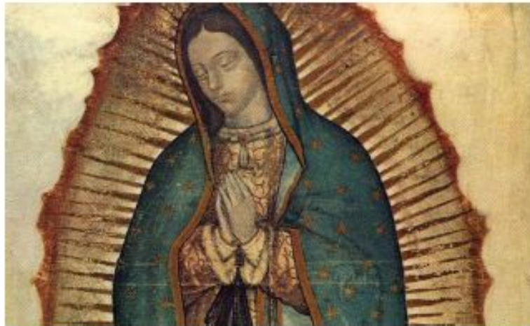
The image of Our Lady on Juan's robe

On December 12, when Juan Diego opened his tilma in the bishop's presence, the roses fell to the ground, and the bishop sank to his knees. On the tilma where the roses had been appeared an image of Mary exactly as she had appeared at the hill of Tepeyac.