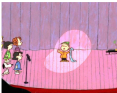
"They will find an infant wrapped in swaddling clothes and lying in a manger." That's what Christmas is all about, Charlie Brown!

Shoppers wait anxiously for hours outside in the bitter cold for bargains and deals, and oh, what some people will do for a deal! But oh, what we will not do for the Lord! And we miss these are sacred moments that in our modern society have turned into something else – something very commercial . But in truth, these moments belong to Christianity! We own them! And over the course of centuries, we have allowed their purpose and meaning to be stolen - hijacked - and turned into commercials and sales. And while they did it, we didn't put up a fight. In fact, we joined in. It's not easy for Christ to compete with all this! The same as it's not easy to convince parents that their child's first communion outfit is not as important as the Eucharist itself – or to convince brides and grooms that their vows are more important than their reception! Even baptisms have become a very expensive affair. We can't compete - but we can do simple things. Nothing complicated. For example, set up a Christmas crib scene in your home. Put Christ in the center and Frosty and Rudolph over on the side. Wouldn't it be beautiful if all Christians, one way or another, identified themselves with the season?