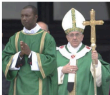
Wearing the green of Ordinary Time

Ordinary Time refers to all of those parts of the Catholic Church's liturgical year that aren't included in the major seasons of Advent, Christmas, Lent, and Easter. The normal liturgical color for Ordinary Time - for those days when there is no special feast - is green. Green vestments and altar cloths have traditionally been associated with the time after Pentecost, the period in which the Church founded by the risen Christ and enlivened by the