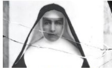
Barbara Cope – Mother Marianne of Molokai