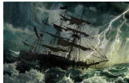
Newton's ship met with a relentless and violent storm

Although John had had some early religious instruction from his mother who had died when he was a child, he had long since given up religion. One day, on a homeward voyage, while he was attempting to steer the ship through a relentless and violent storm, he experienced what he was to refer to later as his "great deliverance." He recorded in his journal that when all seemed lost and the ship would surely sink, he exclaimed, "Lord, have mercy upon us." Miraculously, the storm cleared and the ship was saved. Later in his cabin John reflected on what he had said and began to believe that God had spoken to him through the storm and that – for the first time in his life – he had found grace. Soon afterward, John Newton gave up the slave trade for good.