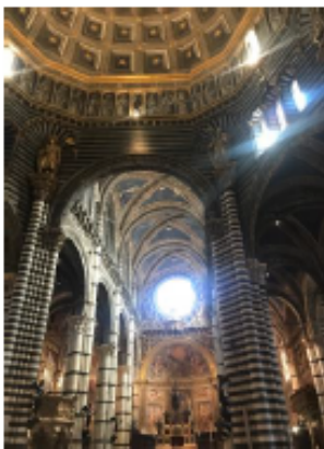
The Cathedral in Siena