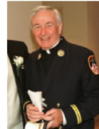
Father Mychal Judge