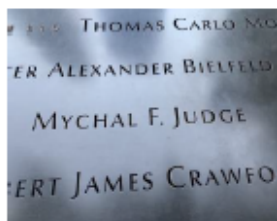
Mychal Judge's name inscribed on the 9/11 Memorial

can get messy, it can get crazy, but it can be an awful lot of fun.' That was the New Yorker in him." Mike knew everyone in the city – from the mayor to the cab driver to his fellow recovering alcoholics – and he spent many hours witnessing his faith to them . On September 11, 2001, upon learning that the World Trade Center had been hit by the first of two jetliners, Father Judge rushed down to the site to be with his fellow firefighters. He was met there by the Mayor of New York City, who asked him to pray for the city and its victims. Father Judge administered the Last Rites to some of the bodies lying on the streets, then entered the lobby of the World Trade Center North Tower, where an emergency command post had been organized.