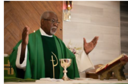
A Priest wearing Ordinary Time green at Mass

The Season of Ordinary Time in the Roman Rite of the Catholic Church refers to two periods of time which together make up the majority of the liturgical Church year. One begins the day after the Feast of the Baptism of the Lord and ends the day before Ash Wednesday. The other begins the Monday after Pentecost and ends the day before the First Sunday of Advent – right about where we are now in the calendar. The weeks in Ordinary Time are numbered, and the word, “ordinary,” comes from the Latin word, ordo , which refers to ordered time.