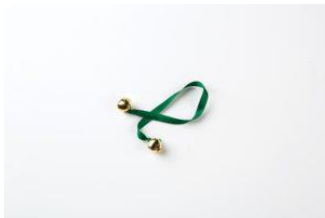
Ribbon with a bell attached (for joyful praise)

Use the dowel or stick and tie on the other 3 things to make a wand to wave.