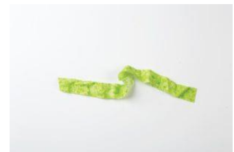
Ribbons or strips of cloth (Garments in the road)