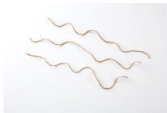
String to represent a donkey's tail