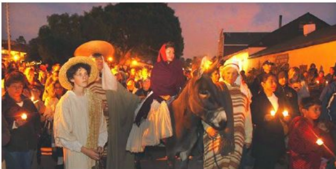
The Posadas Procession

As humans, we often pride ourselves on our ability to reason. But as Pedro's life shows, other skills may be an even more crucial element of our humanity than a clever mind: compassion, imagination, love. Unable to master studies for the priesthood despite his efforts, Pedro responded to the needs of homeless and sick people; he provided education to the poor and salvation to the rich. He became holy—as fully human as any of us can ever be.