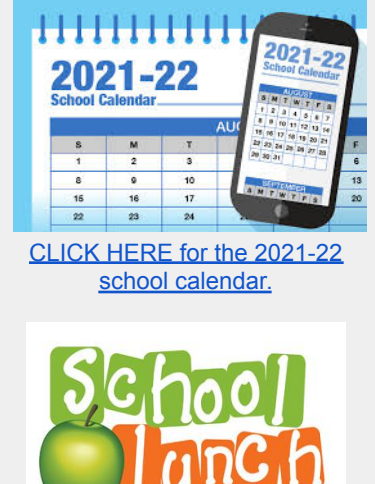
CLICK HERE for the LUNCH