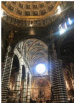
The Cathedral in Siena