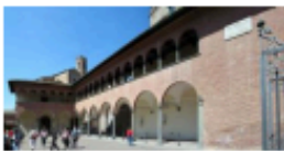
St Catherine's House