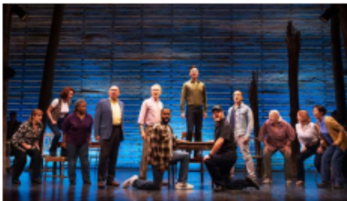
Scene from the Broadway musical COME FROM AWAY